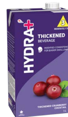
CRANBERRY COCKTAIL 10067311377624