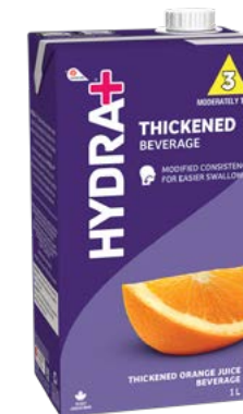
ORANGE JUICE BEVERAGE 10067311377204