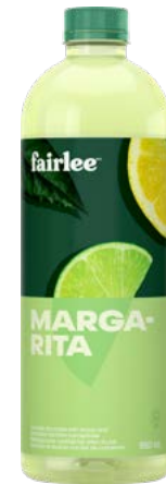
MARGARITA MIX 10067311897665 ❄️ FROZEN