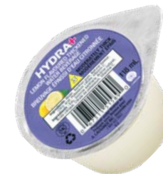
LEMON FLAVOURED WATER BEVERAGE 10067311515897