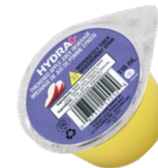
APPLE JUICE BEVERAGE 10067311515521