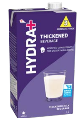
MILK BEVERAGE 10067311377327