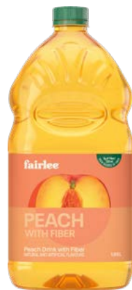
PEACH WITH FIBRE 10067311896132