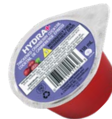
CRANBERRY COCKTAIL 10067311515620