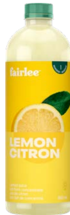
LEMON 10067311897894 ❄️ FROZEN