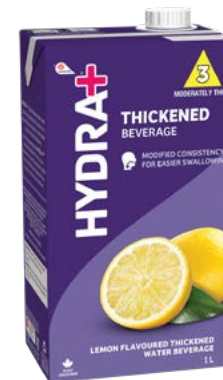
LEMON FLAVOURED WATER BEVERAGE 10067311377891