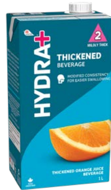
ORANGE JUICE BEVERAGE 10067311367205