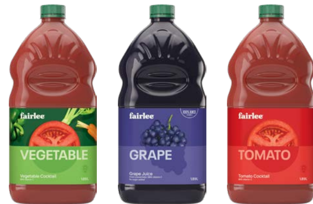
VEGETABLE COCKTAIL 10067311896309