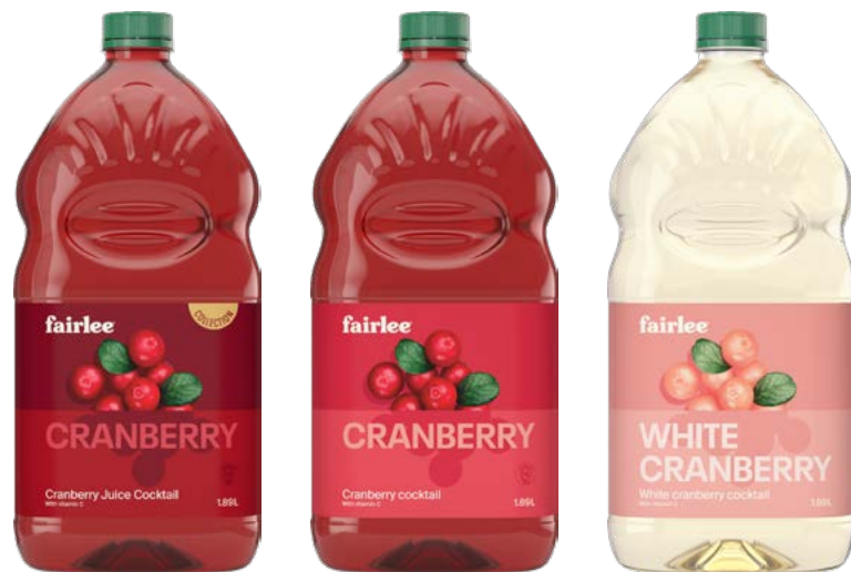
CRANBERRY JUICE COCKTAIL COLLECTION 10067311898624