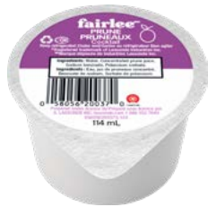
PRUNE COCKTAIL 058056720588