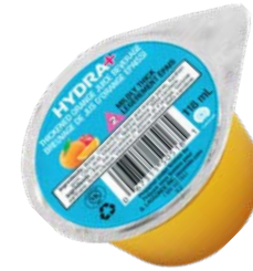
ORANGE JUICE BEVERAGE 10067311505188