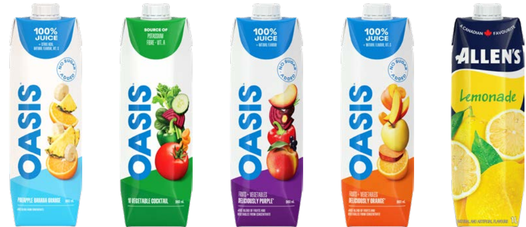
PINEAPPLE - BANANA - ORANGE 10067311061332 10 VEGETABLE COCKTAIL 10067311030338 DELICIOUSLY PURPLE 10067311160721 DELICIOUSLY ORANGE 10067311607318 LEMONADE 10056412503582