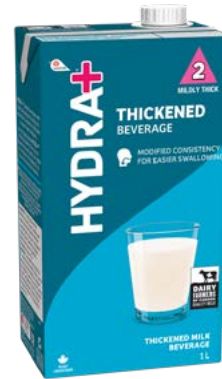
MILK BEVERAGE 10067311367328