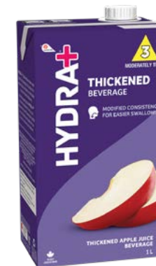
APPLE JUICE BEVERAGE 10067311377525