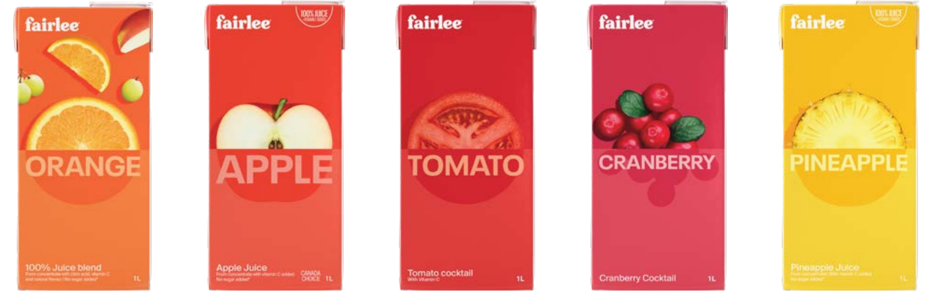
ORANGE BLEND 10058056500187