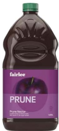
PRUNE NECTAR 10067311896330