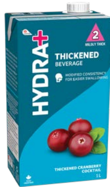
CRANBERRY COCKTAIL 10067311367625