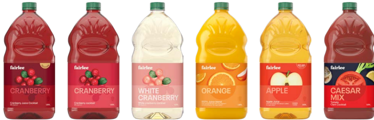
CRANBERRY JUICE COCKTAIL COLLECTION 10067311898624