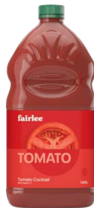
TOMATO COCKTAIL 10067311896842