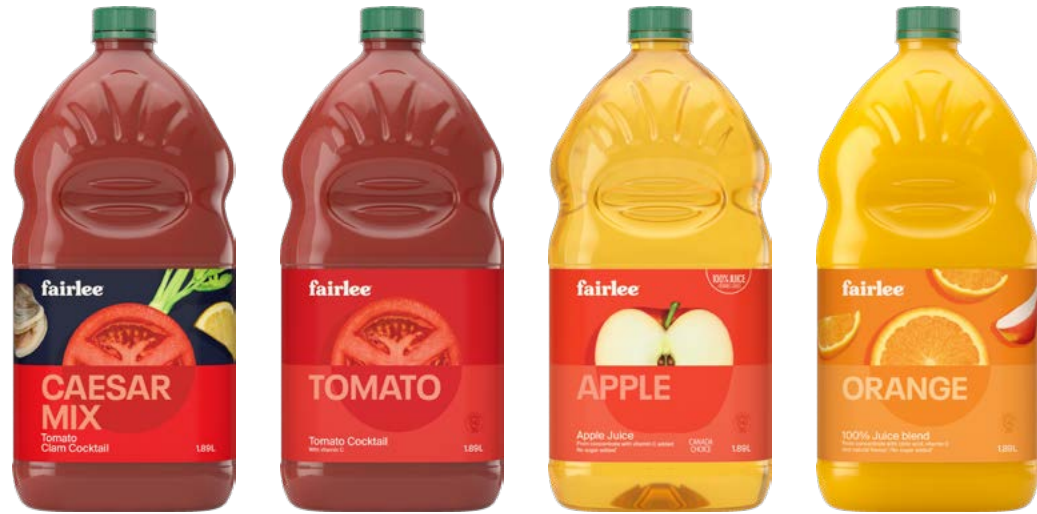
CAESAR MIX 10067311896316