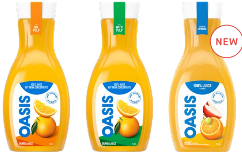
ORANGE WITHOUT PULP 10067311185205 ORANGE WITH PULP 10067311185441 ORANGE JUICE BLEND 10067311184185