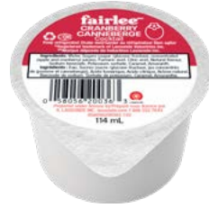
CRANBERRY COCKTAIL 058056720519