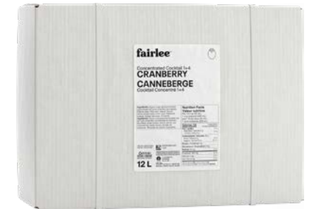
CRANBERRY COCKTAIL 058056548625