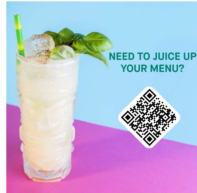
WHITE CRANBERRY COCKTAIL 10067311896613