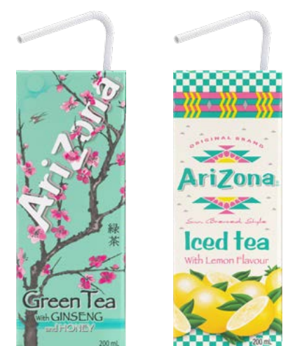
GREEN TEA WITH GINSENG AND HONEY 10613008752283