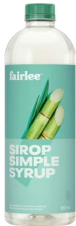
SIMPLE SYRUP 10067311895692