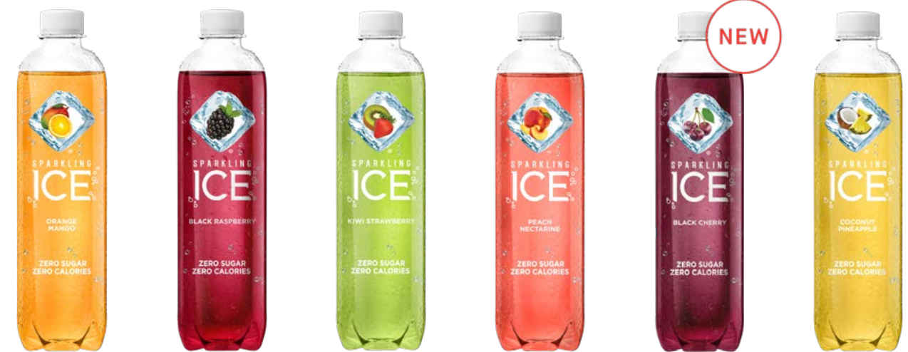
ORANGE - MANGO 016571940119