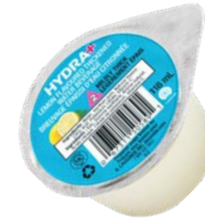
LEMON FLAVOURED WATER BEVERAGE 10067311505898