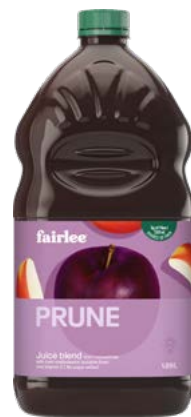
PRUNE JUICE BLEND 10067311896194