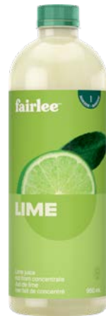
LIME 10067311897016 ❄️ FROZEN