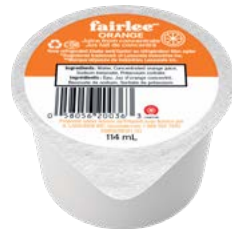
ORANGE BLEND 058056720182