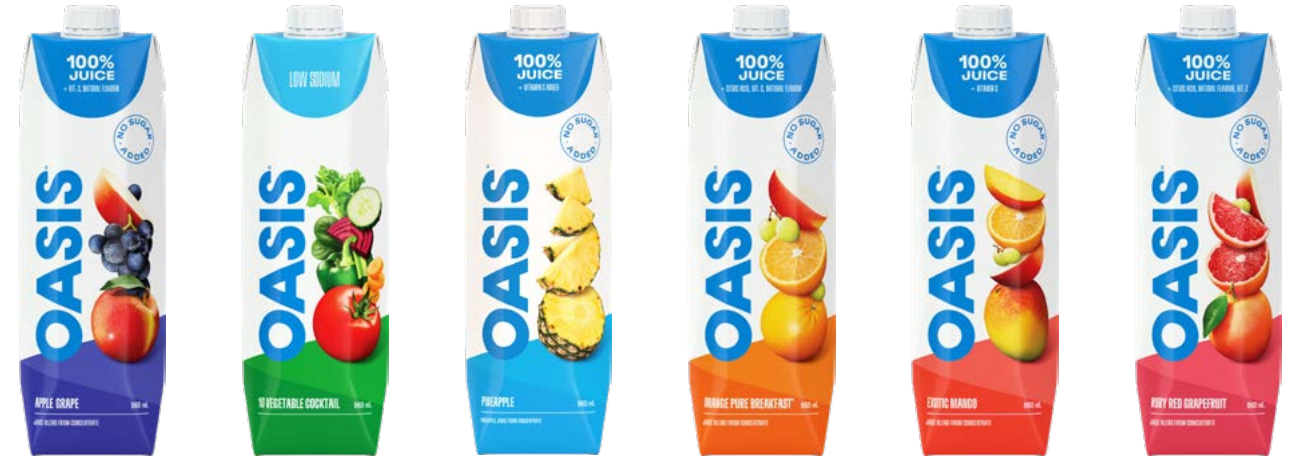
APPLE - GRAPE 10067311016332 10 VEGETABLE COCKTAIL LOW SODIUM 10067311003332 PINEAPPLE 10067311028335 ORANGE PURE BREAKFAST 10067311018336 EXOTIC MANGO 10067311037337 RUBY RED GRAPEFRUIT 10067311031335