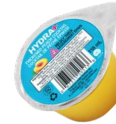
PEACH COCKTAIL 10067311505133