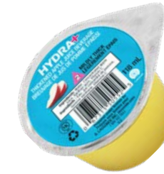
APPLE JUICE BEVERAGE 10067311505522