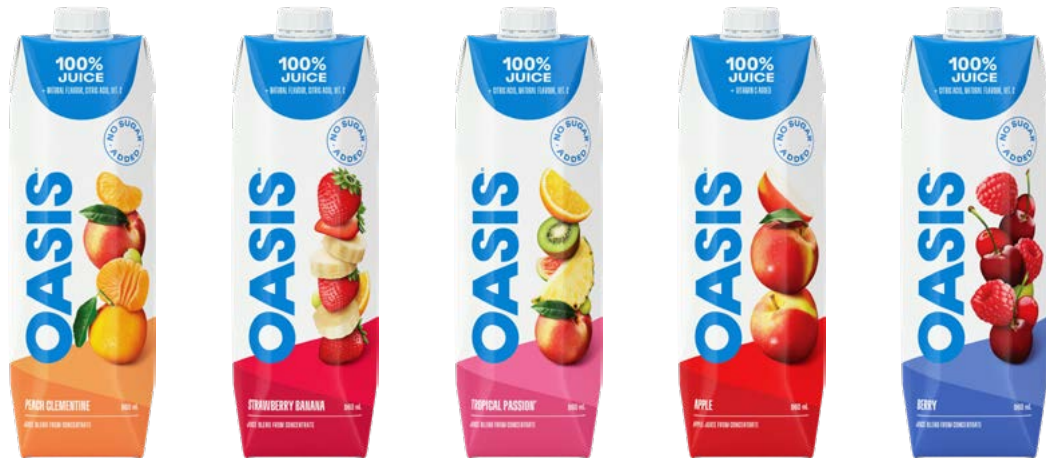
PEACH - CLEMENTINE 10067311040139 STRAWBERRY - BANANA 10067311040122 TROPICAL PASSION 10067311041334 APPLE 10067311010330 BERRY 10067311074332