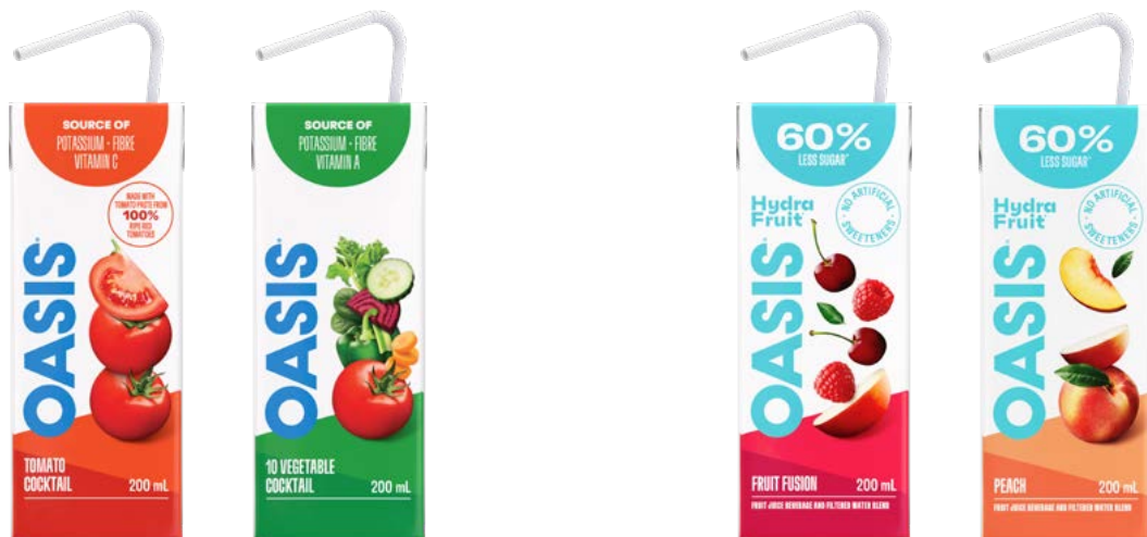
TOMATO COCKTAIL 10067311084294

30 X 200 mL Fruit Juice Beverage and Filtered Water