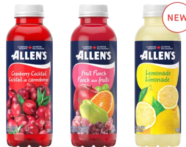
CRANBERRY COCKTAIL 056412740621