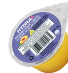
PEACH COCKTAIL 10067311515132