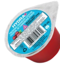
CRANBERRY COCKTAIL 10067311505621