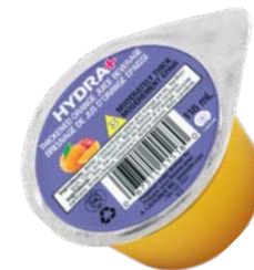
ORANGE JUICE BEVERAGE 10067311515187