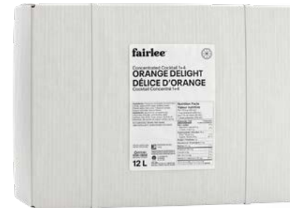
ORANGE DELIGHT 058056548182